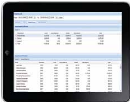
Mobile Ready Web-based Interface

Intellibill are doing good for cost control, with limit budget feature, administrator can set budget for individual or group of user, phone will automatic change to restricted mode ( not allow call out) when user reach their setting budget.